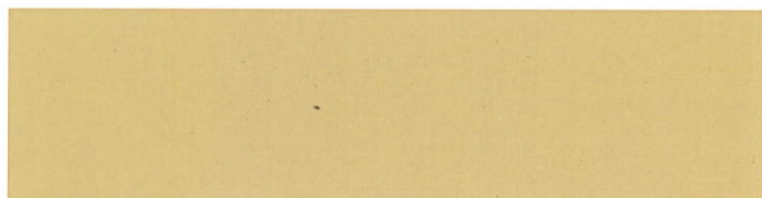
Beige RAL 1001