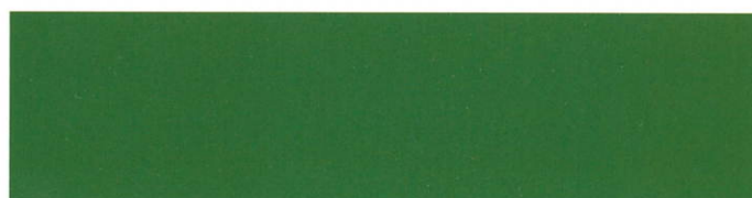
Grass Green RAL 6010